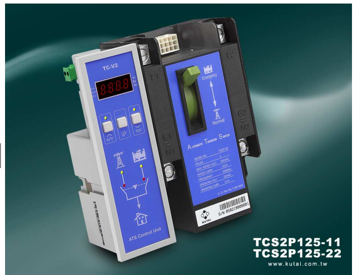
TCS2P125-11 TCS2P125-22 www.kutai.com.tw